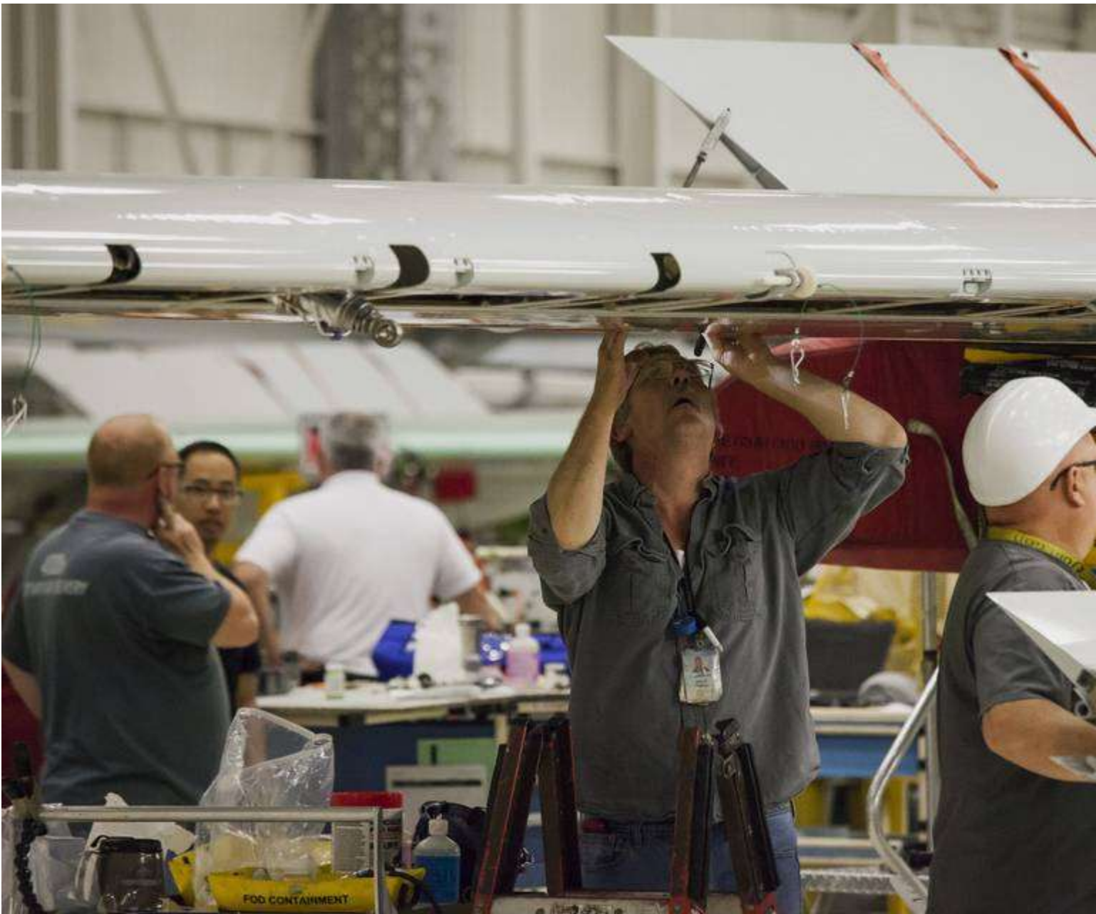
Employees install panels on airplane wings at the Boeing Co. manufacturing facility in Renton, Wash., last year.

Number of open positions highest in 15 years, with many workers not possessing skills to do today's jobs