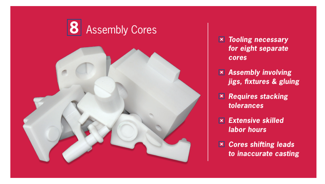
A PUZZLING CHALLENGE: Producing this sand core the conventional way required a lot of work.

A foundry had a problem – their project was going to require 8 different cores to be produced and then assembled. Not only was this project going to require the production of 8 different sets of tooling for 8 different cores, but it was also going to involve assembly steps that included jigs, fixtures and the gluing together of all 8 components. An assembly this complex was likely going to lead to extensive skilled labor hours and a very lengthy production time. The glue and fit of the cores were also added areas of concern due to the high level of variability and scrap which were inevitable during the casting process. That's why this foundry turned to Humtown Additive.